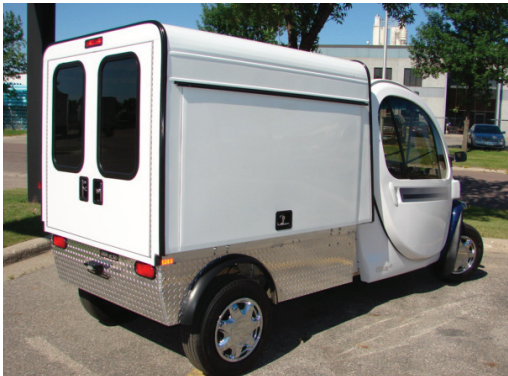
MAX BOX by GEM

To view the wide selection of Global Electric Motorcars factory approved parts, accessories, and upgrades available for your GEM vehicle go to www.nevservice.biz or you can call 1.866.764.0616 to request a catalog be mailed to you at no charge.